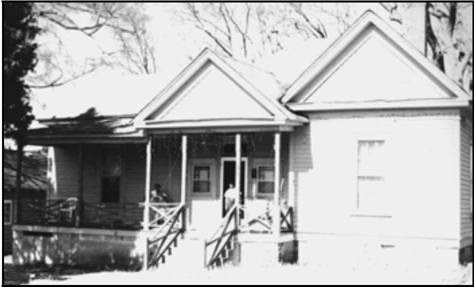
Figure 20. 136 East Lacy Street, Site 093 0058.