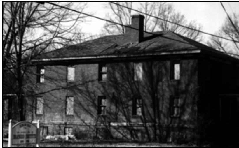
Figure 5. Kumler Hall at Brainerd Institute, Site 093 0249.

mechanical, classical, college preparatory, and teacher training. The surviving building is Kumler Hall, a two-story boys' dormitory constructed circa 1916. The building is significant as the only extant reminder of one of the most successful black educational institutions in the New South. 43