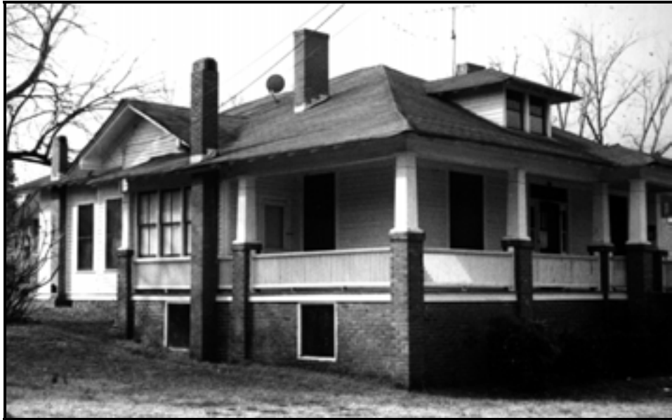
Figure 15. Craftsman style home, 115 Lancaster Street, Site 093 0085.

Chester consider 149 Lancaster Street (site 093 0073) as eligible for the National Register of Historic Places under Criterion C: Architecture.