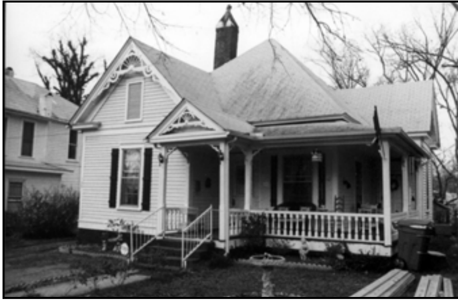
Figure 19. 128 College Street, Site 093 0136.

The Lancaster-East Lacy Streets area also has a significant concentration of historic properties that contribute to the historic character of the neighborhood. The resources such as 136 East Lacy (site 093 0058) and 127 Lancaster Street (site 093 0089), while not individually eligible, are distinctive in their own way. As discussed above, 149 Lancaster Street (site 093 0073), 115 Lancaster Street (site 093 0085) and 151 Lancaster Street (site 093 0256) are all individually distinctive. The diverse architectural forms found in the district convey the historic character of the neighborhood. The types of architecture found in this potential district include antebellum Greek Revival, Carolina farmhouses, Queen Anne, Craftsman-Bungalow, and Minimal Traditional. The many different forms give evidence of the architectural growth of the neighborhood and the city of Chester. The area additionally presents an aesthetic of a traditional residential setting with its tree-lined streetscape. This district possesses a high level of architectural integrity and we recommend the residential area of the Lancaster-East Lacy Streets area as eligible for the National Register of Historic Places as a district. We also recommend that the City of Chester consider the Lancaster-East Lacy Streets area for local designation as a historic district.