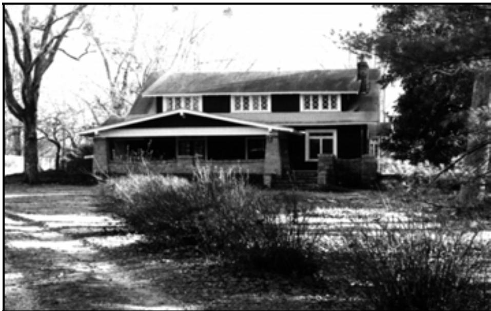
Figure 16. Craftsman Bungalow style home, 149 Lancaster Street, Site 093 0073.

A few houses in the survey area represent the Minimal Traditional style. Houses built after World War II generally lacked the formality and recognized stylistic associations that characterized houses built in the