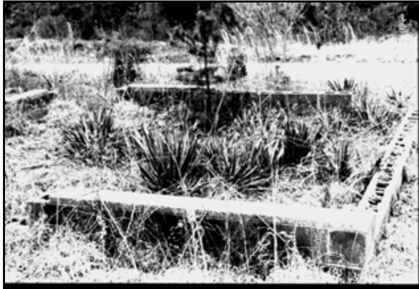
Figure 9. Gravesite at Mount Hebron Cemetery, Site 093 0274.