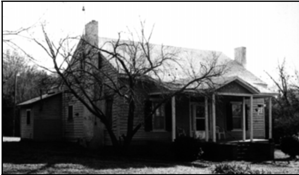
Figure 12. Knox Cottage, 167 East Lacy Street, Site 093 0081.

when the pedimented front facing gable was added to a shed roof. We recommend the City of Chester consider the Knox Cottage (site 093 0081) as eligible for the National Register of Historic Places under Criterion C: Architecture.