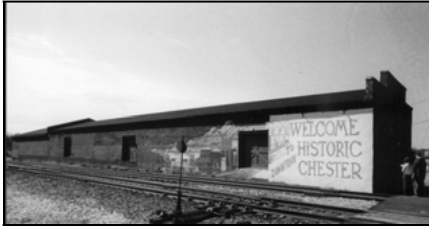
Figure 7. Southern Railway Freight Depot on Gadsden Street, Site 093 0259.