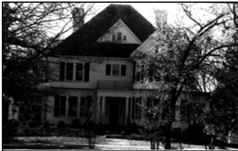
Figure 14. Queen Anne style home, 151 Lancaster Street, Site 093 0256.

triplet windows in a nine-over-one sash, and a substantial entrance bay. Early twentieth-century additions, most likely in the 1930s, include Neoclassical styling and an entry bay and port cochere on both the east and west elevations. Later modifications include modern porch supports at the main entry door. This property anchors a potential national historic district. Its architectural integrity and imposing presence announces to visitors the entrance to the historic core of the city. We recommend the City of Chester consider 151 Lancaster Street (site 093 0256) as eligible for the National Register of Historic Places under Criterion C: Architecture.