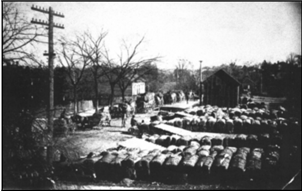
Figure 4. Cotton gin located on Hinton Street, circa 1910.

Commercial Development: The Railroad By enabling the spread of cotton culture and the growth of interior southern cities, the locomotive helped to expand the newly incorporated town of Chester. It offered economic opportunity to southern towns that before the railway had few links to the national market. In the postbellum era the railroad had its largest development in the southern states as it also brought the promise of a New South. 8 As with the rest of the region, the arrival of the railroad in Chester stimulated population growth and industrial development. By connecting Chester to other southern cities, it offered new employment, economic and travel opportunities, and later facilitated the growth of industry.