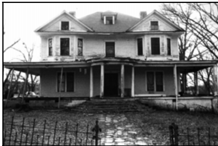
Figure 13. Queen Anne style home, 129 College Street, Site 093 0134.

We identified over twenty Queen Anne houses in the survey area. All were built between 1875 and 1895. Some of these clearly show the rich ornamentation that is associated with this style, while others show a more basic adaptation. Three residences that exemplify the style are at 120 Lancaster Street (site 093 0094), 129 College Street (site 093 0134), and 128 College Street (site 093 0136). The property at 128 College Street is a fine example of the style with textbook architectural details including verge board detailing, chamfered columns with scroll sawn brackets, turned baluster railings, and two entrances on the porch with flanking paired colonnettes. The house at 129 College Street has four two-story polygonal bays, two that flank the main door on the front elevation and one on each side elevation. The main entrance is a double door flanked by colonnettes. A Victorian era fence surrounds the lot.