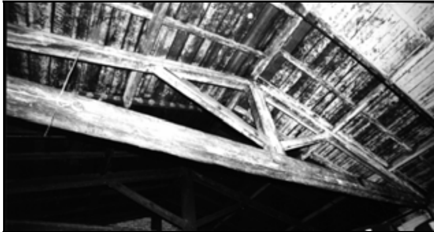
Figure 8. Inside view of Southern Railway Freight Depot, Site 093 0259.