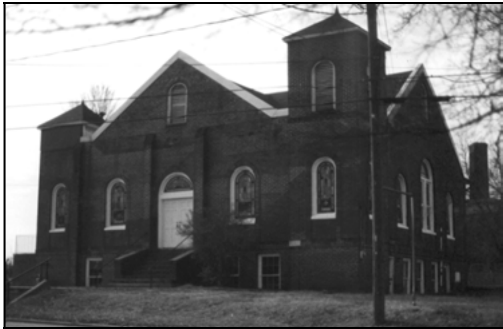
Figure 11. Carmel Presbyterian Church, 134 Walnut Street, Site 093 0217.

Carmel Presbyterian Church was the primary church associated with the students, faculty, and citizens of the Brainerd Institute community in East Chester. The building reflects an African-American community in Chester that was as affluent as any other in the state of South Carolina during the period it was built. The church's construction utilized the local community's own abilities, creativity, designs and building skills rather than hiring out those services from local white artisans. The result was a building influenced by distinctive national styles and community tastes. Significant features of the Carmel church include Romanesque Revival influences, such as large bell towers on the main façade, fully engaged buttresses and a Craftsman-influenced stacked header belt course of ornamental brickwork. Despite recent modifications, the church retains a high level of architectural integrity, and its historical association with Brainerd Institute makes it an important resource. We recommend Carmel Presbyterian Church (site 093 0217) as eligible for the National Register of Historic Places under Criterion A: African-American Education and Criterion C: Architecture.