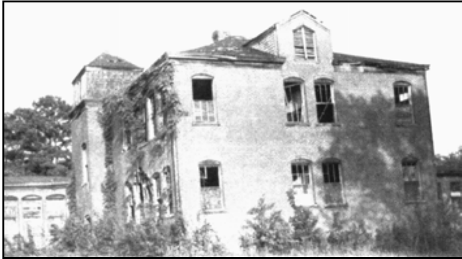
Figure 6. Classroom building at Brainerd Institute that is no longer standing.

Brainerd occupied several locations before finally settling on the present site, the old DeGraggenreid land, where the mansion house was used as the main building. Other buildings constructed included boys' and girls' dormitories. Brainerd Institute was committed to high standards in its academic program and in the conduct of its pupils. In addition to basic academic courses, each student fulfilled the requirements for one of the major courses of study. Students also attended classes in food conduct and Bible study and were required to attend the Presbyterian Church each Sunday. There were several religious organizations on campus and every student was a member of each one. The young ladies were required to wear sedate uniforms and all students lived by a strict set of regulations. 46