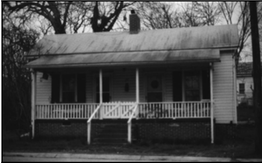
Figure 18. Springsteen Mill Village home, 33 White Street, Site 093 0193.

The pattern of houses in the mill village has remained intact, with closely spaced houses on very small lots. The integrity of the village's landscape design is therefore good. However, there are two other significant losses of integrity which compromise the integrity of the village as a historic district. First, many of the houses have been altered with vinyl siding, replacement windows and doors, decorative metal porch supports, new foundations, and new composition shingle roofs. As a result of these changes many of the houses no longer reflect their period of significance. Secondly, the Springsteen Mill building has lost so much of its integrity that it was not included in this survey. Because the mill provides a crucial part of the historical context for the mill village, the multiple character-altering additions to the mill make it difficult for the village to be a viable historic district, particularly given the loss of integrity of so many of the houses. For these reasons, we do not recommend the Springsteen Mill Village as eligible for the National Register of Historic Places.