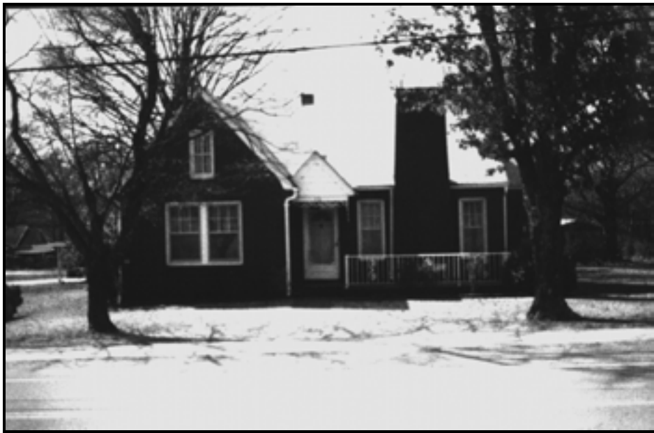
Figure 17. Minimal Traditional style home, 129 Cemetery Street, Site 093 0254.

early twentieth century. However, McAlester and McAlester have identified a national style under which many of the new suburban houses which were built beginning in the 1930s and flourishing after World War II. They created the stylistic designation “Minimal Traditional” for this group of houses. 70 These tend to be one-story houses with prominent off-center gables on the front, constructed of brick. Their inspiration is roughly Tudor Revival, given the roof configuration, but they lack any other identifiable style. Given the tight time frame within which they often were built, they tended to be built in readily identifiable tracts or subdivisions. Four houses in the survey area can be identified as Minimal Traditional in style: 143 Lancaster Street (site 093 0074), 139 Lancaster Street (site 093 0076), 110 Loomis Street (site 093 0245), and 129 Cemetery Street (site 093 0254). The remaining houses from the twentieth century in the Gadsden-Lancaster Streets corridor cannot be identified with any national, academic style.