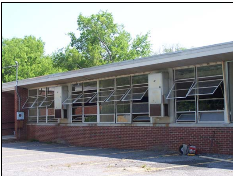
Figure 3. Central Elementary School (white), 1957, Lancaster, South Carolina Photograph by Rebekah Dobrasko, 2007

Many existing schools received substantial additions as part of the equalization school construction program. Although the older portions of the school may not reflect the building trends of the post-war era, the flat roofs, metal windows, and brick veneer clearly identify the 1950s additions. Chicora Elementary School in North Charleston was constructed in the 1920s, and it received an addition in 1955 (Figure 4). The historic section reflects the traditional architecture of the 1920s, and the 1955 addition shows the streamlined, modern architecture popular after World War II (Figure 5). Dennis High School in Lee County is listed in the National Register of Historic Places for its significance in African American education. The Lee County School Board built a Modern addition to the original Classical Revival style Dennis High School as part of its equalization program. This addition contributes to the historic significance of Dennis High. 25