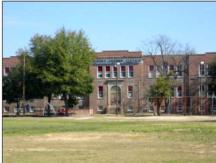
Figure 4. Chicora Elementary School (white), c.1920, North Charleston, South Carolina