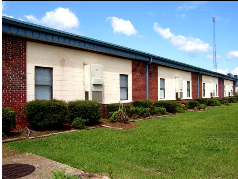
Figure 6. Scott's Branch High School (black), 1952, Summerville, South Carolina Photograph by Rebekah Dobrasko, 2007

equalization schools may retain their historic window openings, but smaller windows have been installed and the larger window openings filled with brick, concrete block, or wood (Figure 6).