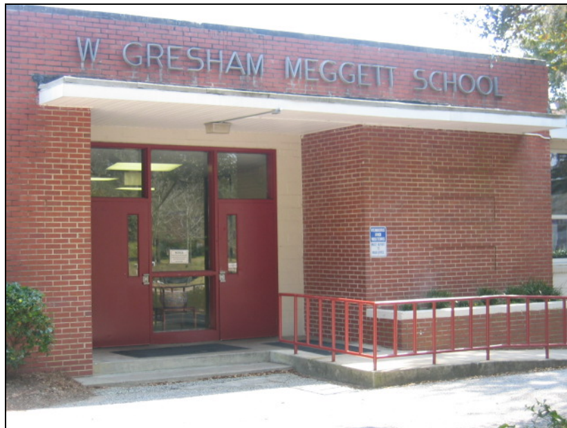
Figure 7. Original Signage for the W. Gresham Meggett High and Elementary School (black), now Septima Clark Corporate Academy, 1953, James Island, South Carolina Photograph by Rebekah Dobrasko, 2005

Additions should be on the side or the rear of the building, and attached by hyphens or walkways. 26 Original signage should also be considered in determining the school's integrity.