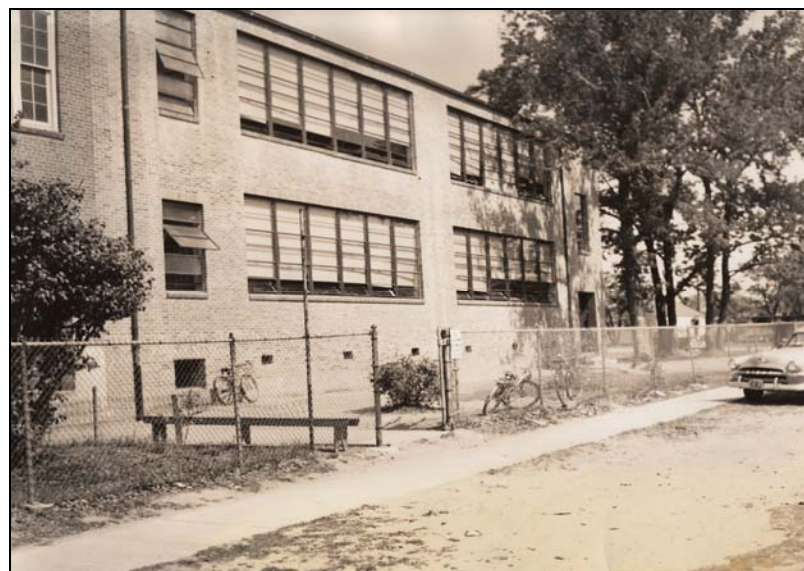
Figure 5. Chicora Elementary School (white), 1955 addition, North Charleston, South Carolina

The equalization schools were designed to take maximum advantage of air flow and natural light in the classrooms. Consequently, as schools began to install central air and heating, school districts viewed the walls of windows as energy deficient and began infilling the openings. School districts no longer wanted to financially maintain the large number of windows that were required as part of the postwar school. Many of the