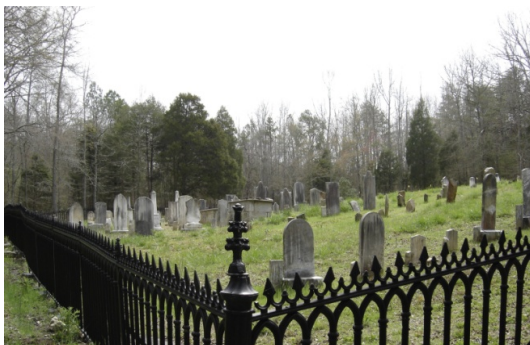
Lindsay Cemetery, Abbeville County

Historic cemeteries may be the only remaining evidence of early settlements. The Zubly Cemetery in Aiken County, established ca. 1790, is the most important extant historic resource associated with the Swiss settlers of New Windsor Township. Historic cemeteries are found everywhere, some plainly evident such as Laurelwood Cemetery (1872) in Rock Hill, Magnolia Cemetery in Charleston (1850), and Springwood Cemetery (1812) in Greenville, while others are tucked into the landscape with few visible markers. Cemeteries were segregated spaces too. The Aiken Colored Cemetery was established in 1852 as the principal burial ground for African Americans in the City of Aiken. Richland Cemetery (1884) in Greenville, Randolph Cemetery (1872) in Columbia, Orangeburg City Cemetery (1889) and Darlington Memorial (1890) are other examples of historic African American cemeteries.