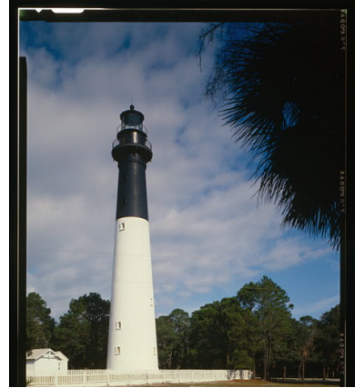
Hunting Island Lighthouse.

Historic canals, such as the Santee Canal in Berkeley County, and Landsford Canal along the Catawba River in Chester County highlight efforts to improve transportation networks, as do historic bridges. The Poinsett Bridge in Greenville County, built in 1820 as part of the State Road designed by Joel Poinsett, is perhaps the state's oldest bridge. Campbell's Covered Bridge (1909), also in Greenville County, is the state's only remaining covered bridge. The Gervais Street Bridge in Columbia built in 1928 and Waccamaw River Memorial Bridge built a decade later at Conway, served growing automobile traffic. Efforts to improve maritime navigation include lighthouses like Hunting Island Lighthouse and Cape Romain Lighthouse. Early aviation history is represented by the Curtiss-Wright Hangar built in 1929 at Columbia's Owens Field.