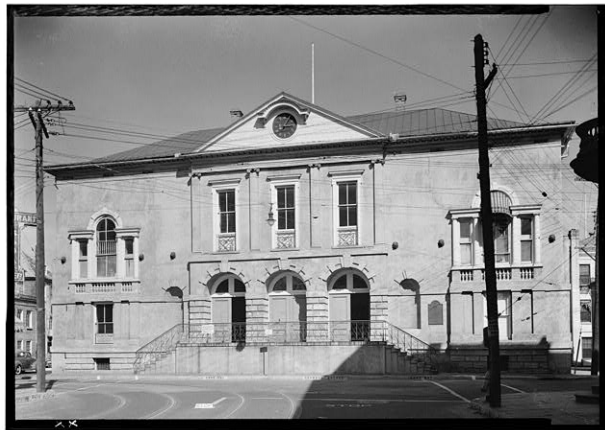
Exchange Building and Custom House, 1938. Library of Congress, Prints & Photographs Division, HABS SC,10-CHAR,72--2

The rescue of the oldest public building in Charleston, the Old Powder Magazine was also a women-led, grassroots preservation campaign. Originally use to store gunpowder, it was abandoned after the American Revolution, then had variety of uses in the 19th century, including wine storage and a commercial printing press. By 1897, the News and Courier reported that the building was “gradually falling to pieces.” Five years later, the National Society of Colonial Dames in the