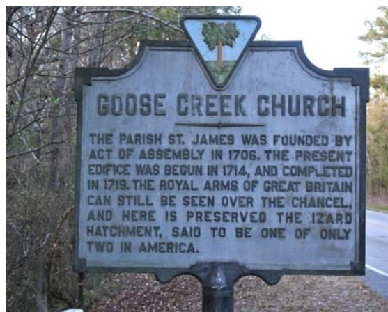
Early state historical marker from the 1930s.

Charleston's significant role in determining and defining historic preservation standards is undeniable. But at almost the same time, efforts to preserve historic places took place in other parts of the state. In 1936, the State Historical Commission (now Department of Archives and History) initiated a statewide historical markers program. A $3,000 Works Progress Administration grant initially funded the program, but eventually "patriotic organizations, public-spirited clubs, generous individuals, and prosperous churches" provided financial support because the Historical Commission received no funds from the state to pay for its markers. 15 It has proven to be a popular program for recognizing historic places, with over 1,700 markers.