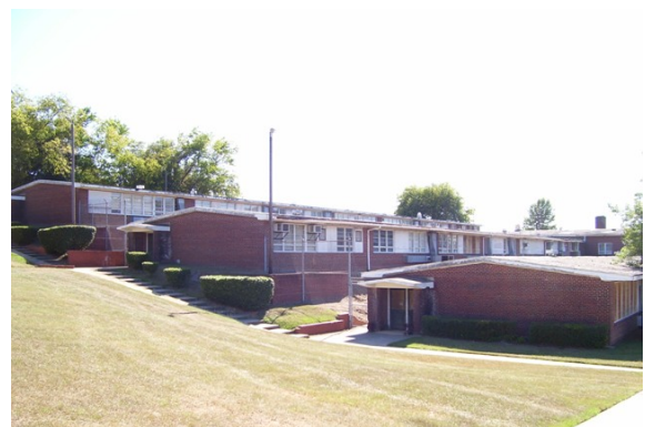
Florence Benson School, Columbia, an Equalization school

After World War II, South Carolinians embraced modern architecture for commercial and institutional buildings. A wave of school construction in the 1950s was the result of the state government's effort to maintain "separate but equal" school systems for black and white children. The typical design of the "Equalization" schools emphasized horizontal lines, sprawling one story wings, banks of windows and flat roofs. Other sites associated with efforts to end segregation include the home of civil rights leader Modjeska Simkins in Columbia, the Progressive Club