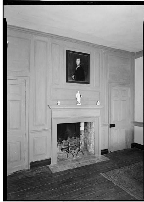
Heyward-Washington House, 1940. Library of Congress, Prints & Photographs Division, HABS SC,10-CHAR,103--8