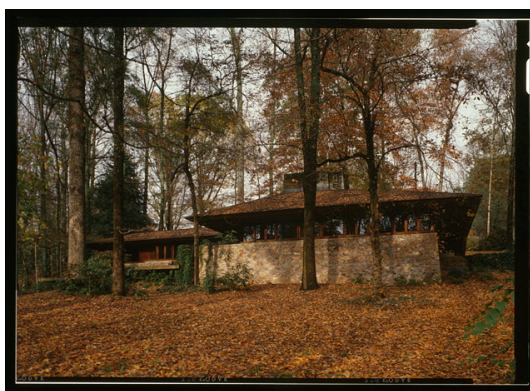
Broad Margin, Greenville. Library of Congress, Prints & Photographs Division HABS SC,23-GRENV,2-29 (CT)