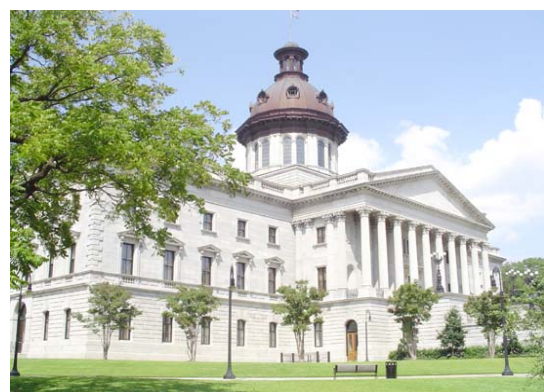
South Carolina Statehouse