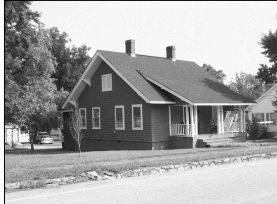
Pacolet Mill Village House

South Carolina experienced increased investment in textile mills after the Civil War and the development of numerous mill villages. The textile industry significantly impacted on the people, economy, and landscape of South Carolina, transforming rural places into towns and towns into cities. The pattern for the mill and village was established at Graniteville, built by William Gregg in the 1840s, with its granite mill and row of carpenter Gothic mill houses. Some mills were built in existing communities such as Spartanburg, Greenville, Newberry, Rock Hill, and Columbia, while the construction of mills spurred development of small towns like Pacolet, Buffalo, Newry, and Great Falls. South Carolina textile mills were among the largest in the world and adopted the most current technology. Expansive multi-story rectangular brick buildings with regularly spaced large windows dotted the Midlands and Upstate. The need for power for the textile mills also led to the construction of dams and early hydroelectric plants.