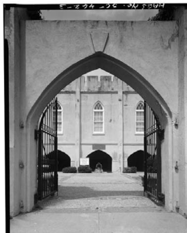
Beaufort Arsenal, no date. Library of Congress Prints & Photographs Division, HABS SC,7-BEAUF,13--3