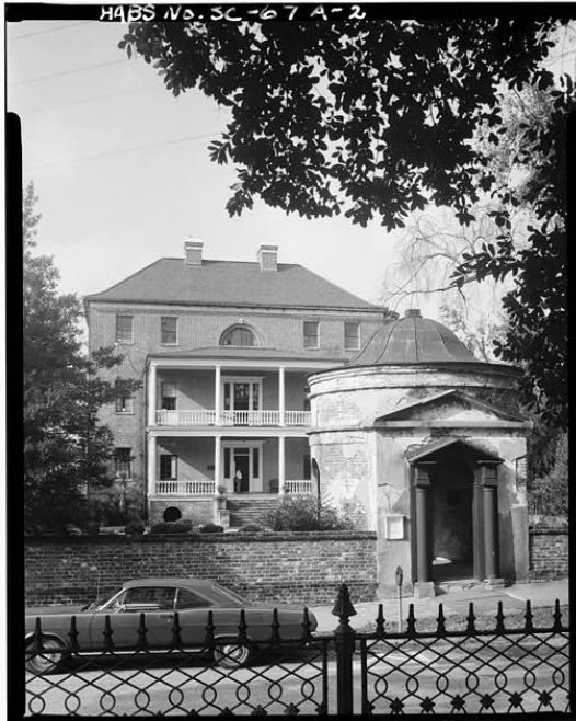
Joseph Manigault House, 1970s.

auction site and opened it in 1938 as the Old Slave Mart Museum focused on the culture and history of enslaved African Americans. 10