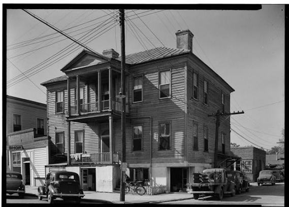
John Mark Verdier House, Beaufort, 1940.

While a destructive force, urban renewal also fostered preservation efforts. The Ainsley Hall House, also known as the Robert Mills House, was saved from demolition in 1961 by a small group of individuals, who officially incorporated as the Historic Columbia Foundation. In Beaufort, a group of preservation-minded individuals, reacting to the potential destruction of the city's downtown historic properties for high-rise hotels and apartments, founded Historic Beaufort Foundation in 1965. They completed survey of 165 historic properties in 1968. Based on this survey, the Beaufort Historic District was listed in the National Register of Historic Places in 1969 and received National Historic Landmark status in 1973.