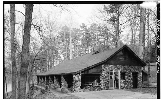
Paris Mountain State Park.

An agricultural depression in South Carolina in the 1920s preceded the Great Depression. New Deal spending can be seen in buildings and landscapes across the state. The Civilian Conservation Corps created 16 state parks between 1934 and 1941, including Oconee State Park, Table Rock State Park, and Paris Mountain State Park. New federal buildings such as the Conway Post Office, Bamberg Post Office, and Haynsworth Federal Building in Greenville, were funded by the Public Works Administration. New Deal dollars also helped build the Lexington County Courthouse and Liberty Colored High School, and Mullins Library. The Ashwood School Gymnasium and Auditorium in Lee County was built in 1938, as part of a New Deal resettlement program. The impact of federal spending also can be seen in the creation and growth of military installations in the first half of the 20 th century, including the historic districts at Parris Island (Marine Corps) and the former Naval Yard in North Charleston. State government also expanded, building the John C. Calhoun Office Building in 1926 and Wade Hampton Office Building in 1940.