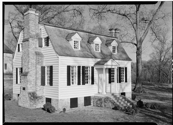
Hanover (Restored), moved to Clemson University.

In the first three decades of the 20 th century, wealthy Northerners were responsible for the preservation of many former plantation houses and lands in the Lowcountry. Industrialists and businessmen purchased Southern plantations to be used as winter homes and outdoor recreation retreats, especially hunting clubs, to aid in the construction of their image as "country gentlemen." Although significant changes were undoubtedly made that sometimes compromised the historic fabric of the properties, Northerners' wealth and their interest in "restoring" plantations was also an early form of preservation work in South Carolina. 19