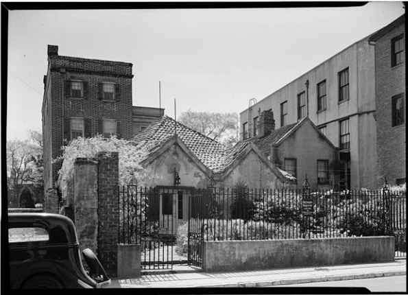
Old Powder Magazine, 1940.

South Carolinian Ann Pamela Cunningham led the effort to save Mount Vernon, widely considered to mark the origins of the historic preservation movement in America. Upon learning of the derelict state of George Washington’s home, Cunningham wrote a letter addressed to the “Ladies of the South!” to raise funds to purchase and restore the founding father’s property. The letter, printed in the Charleston Mercury in December 1853, was followed by a public meeting in Laurens District to raise funds. Soon women throughout the North and the South held similar meetings under the auspice of “Mount Vernon Associations.” In 1856, the Virginia legislature granted a charter to the Mount Vernon Ladies’ Association of the Union to operate the home as a museum with Cunningham as the organization’s first regent. 1 (The Association continues to operate the house and grounds as a museum property today.) Cunningham and the Mount Vernon Ladies’ Association set the precedent that preservation is a community-based, citizen-led endeavor. 2