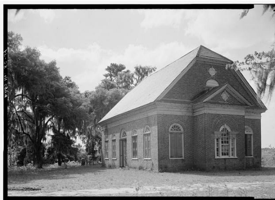
Pompion Hill Chapel, Cooper River, in 1940. Library of Congress, Prints & Photographs Division, HABS SC,8-HUG.V.2--3

Settlements spread along the coast and into the interior, and towns were established for commerce and trade at Beaufort (1711), Georgetown (1729), and Camden (1733/1758). Historic districts in these towns encompass the core commercial and residential areas and include structures from the 18 th , 19 th , and 20 th centuries. A unique early construction material, tabby, a concrete made from lime, sand and oyster shells, is found in several buildings in and around Beaufort. While these towns survive, other early settlements exist primarily as archaeological sites. For example, Colonial Dorchester State Historic Site is the site of Dorchester, a town established in 1697 but abandoned by 1788. Oconee Station (pre-1760) in Oconee County in the northwestern corner of the state marks the farthest point of European settlement prior to the Revolution. Other early buildings include Thorntree in Kingstree (1749) in Williamsburg County, Pegues Place in Marlboro County (ca. 1770), Saint David's Episcopal Church in Cheraw (ca. 1770-1773), and Walnut Grove Plantation in Spartanburg County (ca. 1765). While settlers relied heavily on rivers for transportation, early roads such as the Kings Highway along the coast allowed limited travel by land.