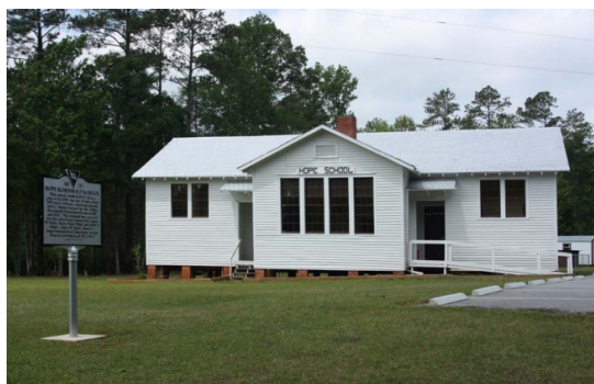
Hope Rosenwald School, Newberry County

From 1917 to 1932, the Julius Rosenwald Fund provided matching grants to build more than 5,300 schools, teachers’ homes, and instructional shops for African Americans in 15 southern states. Nearly 500 were located in South Carolina.