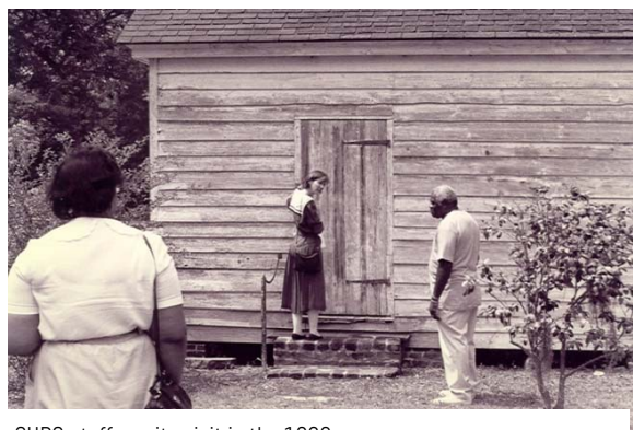
SHPO staff on site visit in the 1980s.

The 1980s saw robust efforts to survey historic properties, add properties to the National Register, carry out federal tax credit projects, and establish local historic districts. Preservationists increasingly focused on the preservation of vernacular structures such as country stores and farm houses, textile mills, landscape features, and archaeological sites. While historic preservation has a long history in South Carolina, some preservation battles were lost, such as the campaigns to save the Old Greenville City Hall in the 1970s, the Columbia High School in the early 1980s, and the South Carolina Penitentiary in the late 1990s. A proposal to expand the boundaries of the Charleston Historic District in the late 1980s did not occur because a majority of owners objected to the designation.