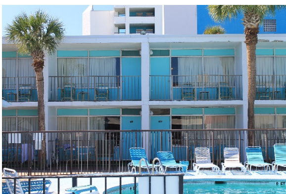
Waikiki Village Motel, Myrtle Beach

Buildings in the postwar years once again reached for the sky, such as the Schuyler Apartments in Spartanburg. Clemson University taught new architects in the Structural Science Building, an early example of Modern or International style built in 1958. The Strom Thurmond Federal Building (1975-1979) in Columbia was designed by the firm of acclaimed architect Marcel Breuer in the Brutalist style. While most South Carolinians favored traditional styles for their homes, two residences by Frank Lloyd Wright were built in the state, Auldbrass Plantation (1949-1951) in Beaufort County and Broad Margin (1951-1954) in Greenville. New suburbs of minimal traditional houses, ranch houses and split levels soon began to take shape on the outskirts of towns and cities. Sprawling strip shopping centers were built along the roads reaching out to these new suburbs, along with rambling one-story motels, fast food restaurants, and gas stations. Mid-century developments and postwar architecture have only begun to be researched and documented by preservation programs.