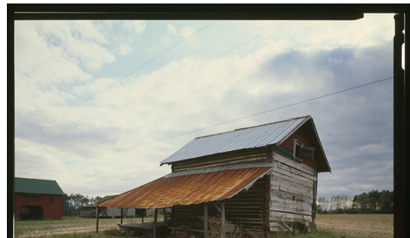
Smith Tobacco Barn, Dillon County.

As agriculture prospered towns such as Marion, Mayesville, Clio, Lake City, Winnsboro, Laurens, and Manning grew. Businessmen built one- and two-story buildings for retail, office, and living space. The buildings were typically of masonry construction and ornamented with brick details, pressed metal, cast stone, and/or terra cotta, in styles such as Italianate, Victorian, and Romanesque. Large store front windows invited customers in and provided light in this pre-electric world. Rural crossroads were often the site of country stores, serving as hubs for commerce and communication. Among the earliest examples is the Lenoir Store built prior to 1878 in Sumter County. Tobacco barns and warehouses in Marion and Dillon counties, are reminders of tobacco's impact on the Pee Dee region. The reign of King Cotton can be seen in an early cotton press in Dillon County and the Palmetto Compress in Columbia. At the Coker Experimental Farms in Hartsville scientific research helped develop improved strains of plants. The Earle R. Taylor House and Peach Packing Shed is an example of the development of peach growing in the Greer area in the 1920s and 1930s. The McPhail Angus Farm in Oconee County is an example of the transition in agriculture from growing cotton as a cash crop to raising cattle and fescue grass.