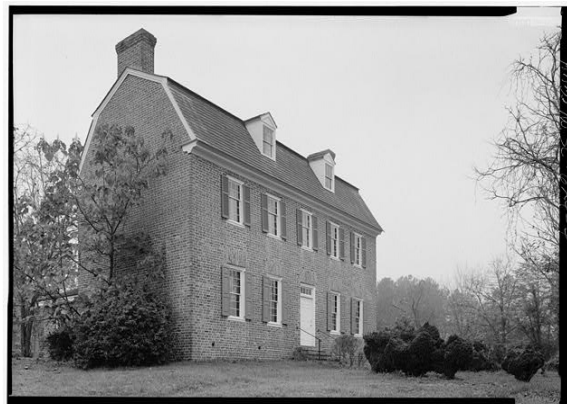
Price House, Spartanburg County. Library of Congress, Prints & Photographs Division, HABS SC,42-M00.V,1--4

Fifty-one historic structures were restored as part of the Tricentennial celebrations, including the Abbeville Opera House, James W. Dillon House in Dillon, John Fox House in Lexington, Old Court House in Newberry, Hampton-Preston House in Columbia, and Price House in Spartanburg County. The first phase of Historic Camden was dedicated. The Tricentennial Commission also successfully purchased the original settlement site and established Charles Towne Landing State Historic Site with funding from federal, state and local governments. Over half a million visitors toured Charles Towne Landing in the year after it opened in April of 1970. 23