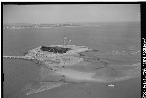
Fort Sumter

South Carolina played a significant role in the Civil War. The Secession Convention in December 1860 began at the First Baptist Church in Columbia before moving to Charleston. The first shots of the Civil War were fired April 12, 1861 on Fort Sumter, now a National Monument. Defensive fortifications remain in the Lowcountry, including the Christ Church lines in Mount Pleasant and batteries and earthworks around Charleston. Sites of armed conflict are commemorated at places like Rivers Bridge State Park in Bamberg County and the Honey Hill-Boyd's Neck Battlefield in Jasper County.