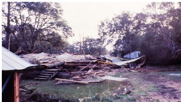
Exchange Plantation Rice Barn after Hurricane Hugo

Hurricane Hugo struck the coast of South Carolina on September 22, 1989. The Category 4 hurricane caused $8 to $10 billion in losses, including significant damage to historic properties in the Lowcountry and beyond. Impacted historic districts included Charleston, Mount Pleasant, McClellanville, Georgetown, Pawley's Island, Murrells Inlet, and Sullivan's Island. High winds and rain also damaged roofs and buildings in several inland areas such as Sumter County.