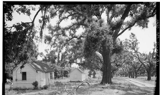
McLeod Plantation slave row.

The flourishing of the South Carolina plantation economy after the Revolutionary War produced grand buildings and transformed the landscape. Numerous examples of 19 th century architectural styles such as Federal, Neoclassical, Greek Revival, and Gothic Revival are found in Charleston. Imposing antebellum buildings Charleston include Rose Hill in Union County, Milford in Sumter outside of County, Hightower Hall in York County, Redcliffe Plantation in Aiken County, and the Rankin Harwell House in Florence County. The Octagan House in Laurens is a rare example of the 19 th century interest in eight-sided buildings. Surviving slave dwellings such as those at McLeod Plantation, Magnolia Plantation, and Boone Hall in Charleston County, and rice fields in the Pee Dee River Rice Planters Historic District in Georgetown County are reminders of the thousands of enslaved individuals who toiled on plantations and whose labor made grand buildings possible. More modest vernacular style homes like the Carolina I-house, two-stories tall and one-room deep are found across the state. While most were of frame construction, some were built of brick.