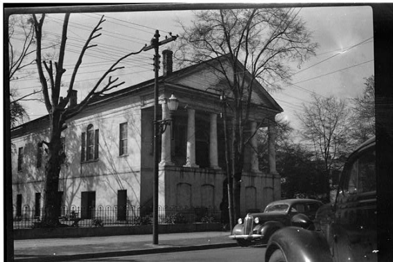
Williamsburg County Courthouse

In Columbia, established as the state capitol in 1786, architect Robert Mills designed the South Carolina Lunatic Asylum, one of the earliest mental hospitals in America built with public funds. Mills also designed county courthouses and jails, and the Fireproof Building for local records in Charleston. South Carolina College was established in 1801 in Columbia, and over the next decades buildings were erected providing academic and living spaces for students and teachers. Private institutions such as Wofford College in Spartanburg and Erskine College in Due West were also established.