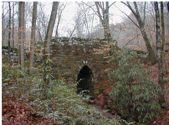
Poinsett Bridge, Greenville County, Heritage Trust site.

Heritage Corridor in 1996, one of the first national heritage areas created by Congress. A decade later, Congress established the Gullah Geechee Cultural Heritage Corridor, along the coastlines of South Carolina, Georgia, and parts of Florida and North Carolina. Other specialized trails have also been mapped, including the Cotton Trail, Francis Marion Trail, Tobacco Trail, and even the Cooper River Heritage Trail, an underwater diving trail connecting six underwater sites. National and state scenic byways programs also provided recognition for historic roads and landscapes such as the Ashley River Road.