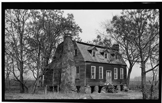
Hanover, Pinopolis, 1940.