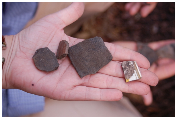
Colonoware and pottery fragments, Ashley River Historic District

Evidence of early settlement is also found in the Ashley River Historic District (Charleston and Dorchester Counties) and the Cooper River Historic District in Berkeley County. These districts contain some of South Carolina's oldest houses and churches, such as Middleburg, Drayton Hall, Strawberry Chapel, and Pompion Hill Chapel. The historic districts also contain archaeological sites documenting the lives of enslaved workers, early transportation routes such as roads and ferries, and remnants of inland and tidal rice fields. Enslaved Africans provided the primary workforce, and by 1720 the black population of South Carolina was twice that of the white population. The Stono River Slave Rebellion in Charleston County is the site of an attempted effort by more than 80 enslaved persons to escape to Spanish Florida in 1739. The revolt resulted in the adoption of more stringent set of laws governing slavery that were in effect until 1865.